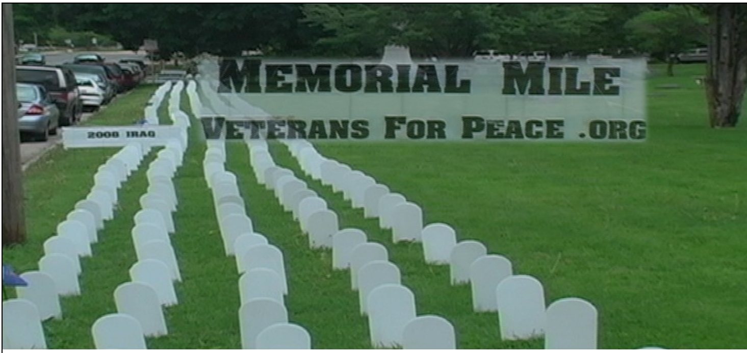
Wednesday, November 11, is Veterans Day

Get in on the fun with costumes, music, and prizes at our Halloween Party on Thursday, October 29 at 2:00 p.m. Add to the fun by coming in a costume.